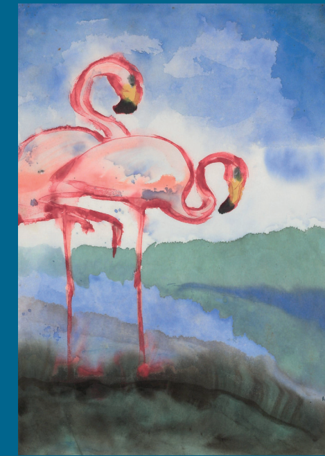
Emil Nolde, Zwei Flamingos [Two Flamingos], 1923/24, watercolor

auditorium, Nolde, assisted by Ada, painted a series of well over 300 watercolors and ink brush drawings with quick, precise brushstrokes, focusing on the expressive possibilities of figures, their movements, dance, gestures, and poses. In his lively watercolors and radiant oil paintings, Nolde pays homage to the bustling city.