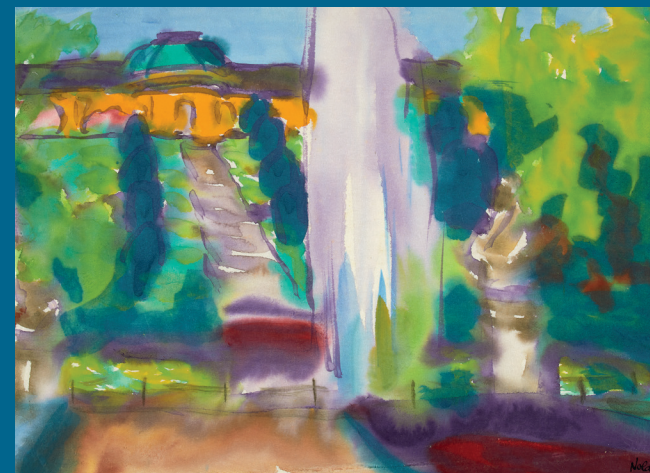
Emil Nolde, Sanssouci, watercolor

Visual artists at the beginning of the 20th century were magnetically attracted to one of the most important metropolises in Europe. Berlin, with its nightlife, dance, theater, and cabaret, also became a source of inspiration for Emil Nolde. Particularly in the years 1910/11, he artistically engaged with the metropolis. Max Reinhardt, director of the Deutsches Theater and the Kammer-spiele, gave Nolde complimentary tickets. In the dark